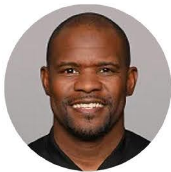
Brian Flores Defensive Coordinator, Minnesota Vikings